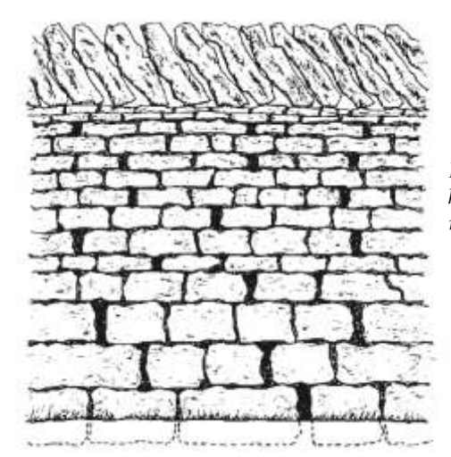
Front elevation showing weep holes in a Yorkshire-style retaining wall

• Dry stone walls are free draining. However, where the hearting is solid (where soil has been incorporated in garden terracing), or where crushed waste is employed, construct weep holes for drainage at 2-3m intervals, more frequently where water is a problem. It is not uncommon to find water from rock strata, field drains, etc when cutting back the bank - and this should be taken away by constructing drains or drainage channels in the foundation to prevent water erosion.